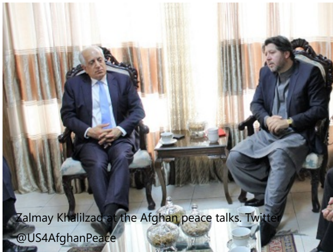
Zalmay Khalilzad at the Afghan peace talks.

While Washington wants the Taliban to negotiate a ceasefire with the Afghan government directly, they are disinclined to do so because they dismiss the government as an American puppet. The afore-noted Taliban official said they are conferring with their leadership the demand to negotiate a ceasefire with Kabul. He, however, did not believe the deal would depend on either direct negotiations or the ceasefire.